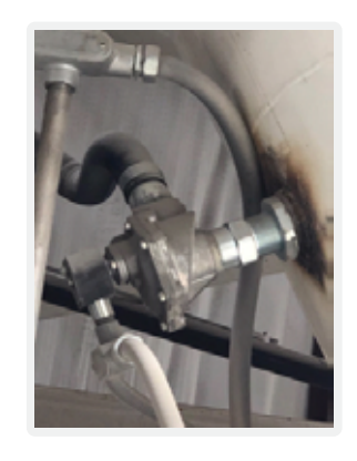
VA-12 Airsweeps® installed on the first bin for initial trial