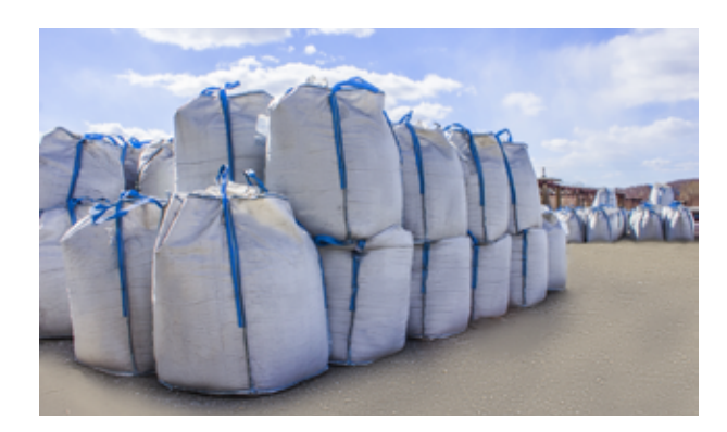
Supersacks filled and ready to go.

The operators stopped using sledgehammers, and production volume increased to the point that an additional forklift driver was hired to keep up with the output of finished product. After the initial trial, the company has since added the AirSweep® system to 16 additional product bins.